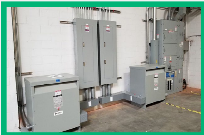
✓ Good access to electrical panels

Below are some examples of good and bad access to emergency items: